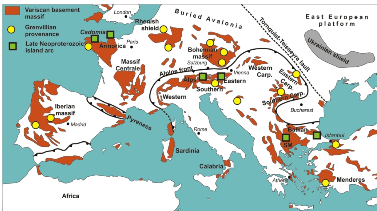
FIGURE 2: Basement terranes in Southern and Central Europe and record of Cadomian/Panafrican orogeny (modified after Neubauer, 2002). See text for data sources and discussion.

Suess (1885, 1888) considered Gondwana-Land with its terrestrial Glossopteris flora to have been a Permian southern continent. Later, it became apparent that Gondwana was a supercontinent in existence from Cambrian to Triassic times. This goes back much further in time than Suess likely envisaged. The new provenance data, particularly of the last two decades, revealed that continental pieces broke away from the northern margin of Gondwana and moved northwards. Avalonia formed an island arc and moved rapidly towards the north, finally attaching to Laurussia in the Silurian after the closure of