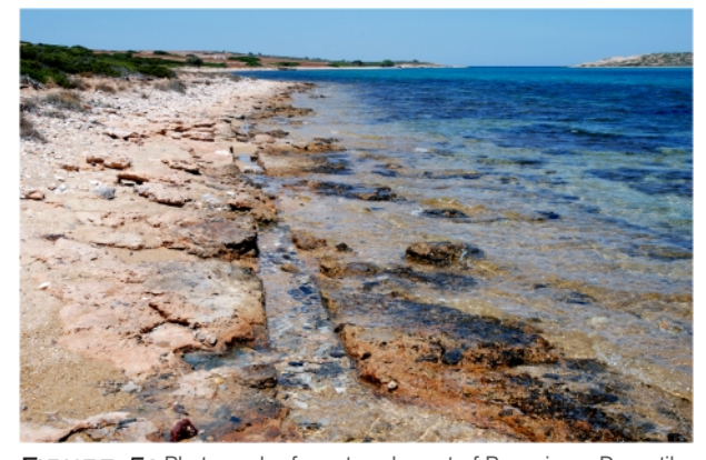
FIGURE 5: Photograph of one trench west of Panagia on Despotiko exposed by waves and currents. View towards northwest, towards the present farmstead. The trenches are some decimetres wide with quite regular, parallel and almost vertical sides. They have been cut into calcrete; the lower part is not exposed.

Probable Early Bronze Age cist graves off Kimitiri, in 3 m water depths provide strong evidence for a land connection between Antiparos and Despotiko still at that time. A Classical marble inscription found at the excavation site of Mandra on Despotiko reading E\Sigma TIA\Sigma I\Sigma OMIA\Sigma (Hestias Isthmias, which essentially means "for Hestia of the Isthmus") may indicate that an isthmus still existed in Classical times (Kourayos, 2006) and probably even later, if the Hellenistic age (Morrison, 1968) of the viticulture trenches on Antiparos is also va-