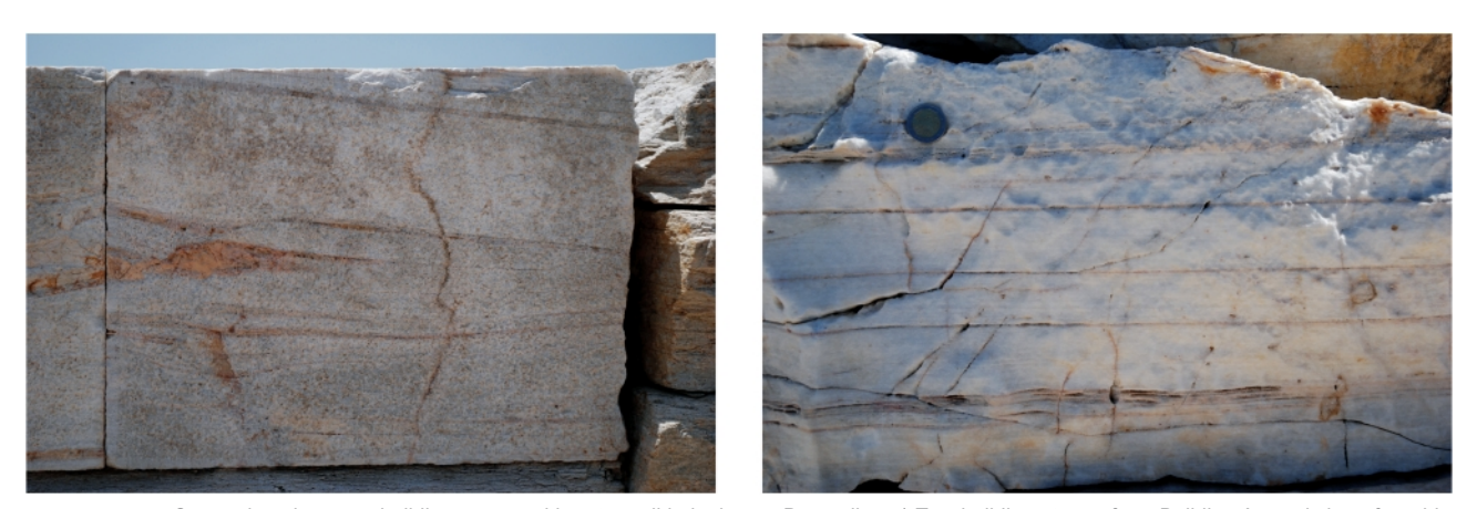
FIGURE 7: Comparison between building stones with outcrop lithologies on Despotiko. a) Two building stones from Building A consisting of marble 1 (centre and left part) from the east façade of room A1. Note the carefully dressed surfaces, the white, slightly greyish colour and especially the characteristic rose-coloured layers of fine grained dolomite marble. The building stones below and to the right comprise white mylonitic gneiss. b) Outcrop photograph of marble from Cape Koutsouros (for location see Figure 3), comprising white, medium grained calcite marble with well developed foliation and characteristic rose coloured, thin dolomite marble layers. Note the close similarity with marble 1 from Building A (for colours see the online version of this paper).

The provenance of marble 2 from the island seems unlikely because its maximum grain size (up to 4 mm) is much larger than that of any marble on Despotiko. Additionally, the pro-