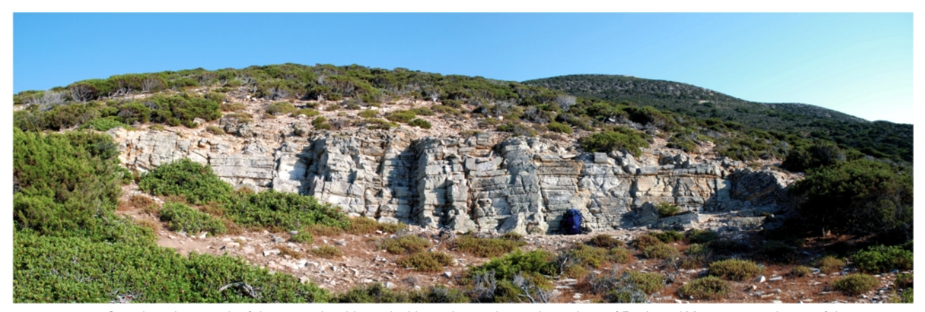
FIGURE 8: Overview photograph of the quarry in white mylonitic gneiss on the northern slope of Raches, 400 m west southwest of the sanctuary (for location see Figures 2 & 3). The quarry is about 16 m long and more than 2 m high. Back bag for scale.

With exception of marble 2 all rock types of the building stones in Building A of the sanctuary can be found on Despotiko and therefore theoretically could originate from the island. Possibly local provenance of at least some building stones is fur-