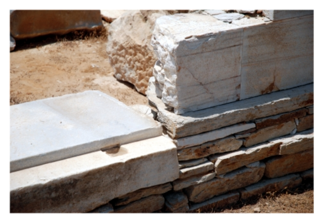
FIGURE 6: East wall of room A2. The large threshold on the left comprises the massive, coarse grained, slightly greyish marble 2. Marble 1 of the well dressed building stones of the east façade is easily distinguished by its well developed foliation and thin, rose-coloured dolomite layers. Foundation stones are made of white, strongly foliated, mylonitic gneiss. Several orange-brown coloured fractures indicate that the stones have been separated in the quarry along the fractures and these fracture surfaces have hardly been modified later (for colours see the online version of this paper).

In addition, modern Despotiko has usually been tentatively equated (e.g. Cramer, 1828, 406; Bursian 1872, 482-483; Kou-