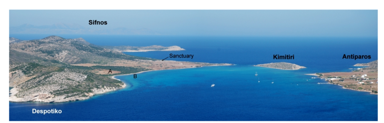
FIGURE 1: Overview of the Despotiko Bay. View towards west-northwest, showing, from left to right Despotiko, Kimitiri and Antiparos islands. The outline of Sifnos is vaguely visible in the left background. The location of the parallel trenches above sea-level is indicated by the letter "A", those under the present sea-level by "B".

Melting of continental ice and thermal expansion of sea-water since the Late Glacial Maximum (ca. 20,000 years ago) has raised the global sea-level by ca. 125 m (Chappell and Shackleton, 1986; Fleming et al., 1998; Caputo, 2007). On a