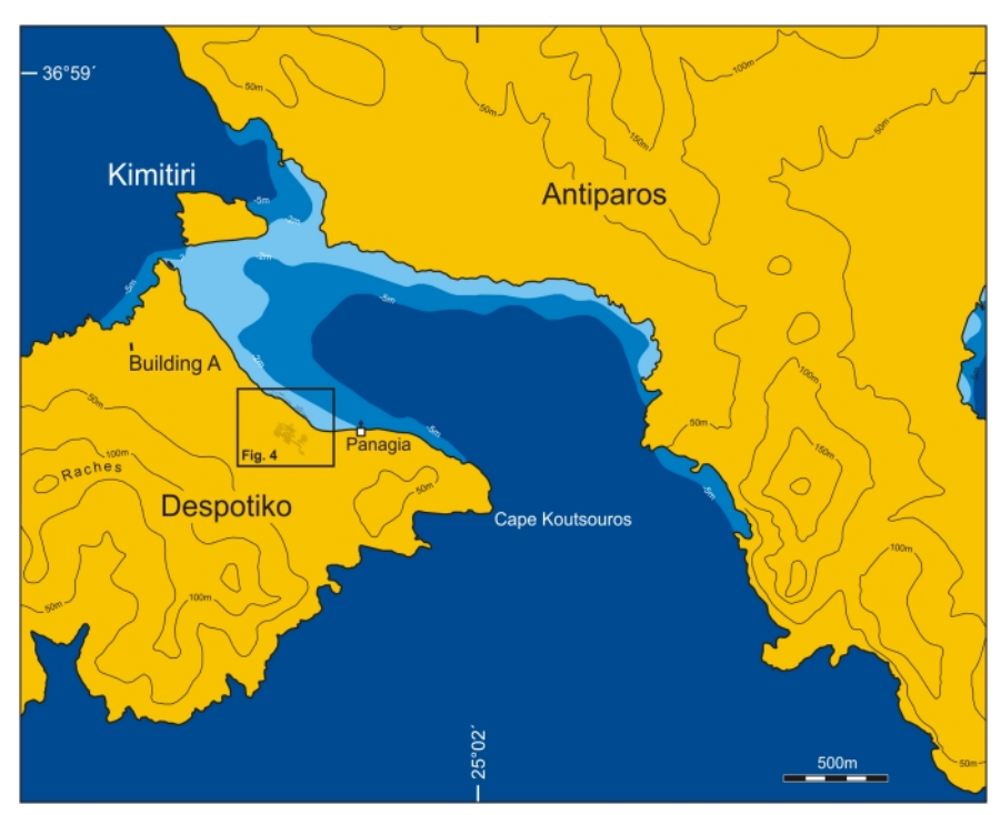
FIGURE 3: Topographic and bathymetric sketch map of Despotiko Bay. The location of Building A on Despotiko is indicated. The coastline, isolines and isobaths are from the 1:20,000 nautical chart (HNHS 1989); heights in metres above mean sea-level, depths under lowest low water. White (yellow in the online version) indicates land above present sea-level, light grey (light blue in the online version) denotes the outline of the isthmus between Antiparos and Despotiko at 2 m relative lowered sea-level and middle grey (blue in the online version) designates the shape of an isthmus at 5 m relatively lowered sea-level. All these reconstructions are based on present sea-bottom geometry, neglecting tectonic movements. Location of Figure 4 is indicated.

The inferior rock quality of the calcrete as building stone and the virtual lack of this rock type in the sanctuary makes interpretations of the trenches as a former quarry very unlikely on Despotiko. Further, the relative sea-level curve for the Cyclades by Poulos et al. (2009) indicates that the lowermost trenches were not submerged before Roman times and thus were constructed on dry land. Therefore interpretations linking the trenches, some of which would have been at least 12 m above sea-level, to sea-based activities (e.g. shipsheds, salt evaporation installations, aquaculture) are implausible. The